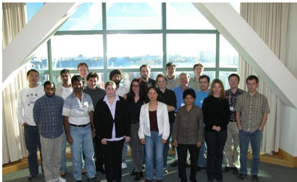
Figure 2: Participants in room 5269 of the Beckman Institute

There were twenty-one participants in the workshop. Each individual applied for a seat, and was selected from a pool of 57 applicants.