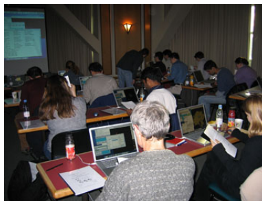
Figure 1: Workshop participants proceed through a tutorial on Apple G4 Laptops in room 5269 of the Beckman Institute

The Hands-on Course in Computational Biology was held at the Beckman Institute for Advanced Science and Technology at the University of Illinois at Urbana-Champaign, during the week of November 8 - 12, 2004. Sponsored by the Theoretical and Computational Biophysics Group (TCBG) and the National Center for Supercomputing Applications (NCSA), the workshop explored physical models and computational approaches used for the simulation of biological systems and the investigation of their function at an atomic level.