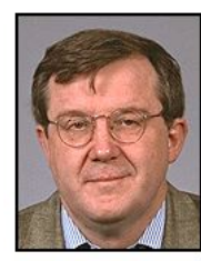
Figure 5: Klaus Schulten

09:00-10:00 Equilibrium Properties of Proteins 10:00-10:40 Nonequilibrium Properties of Proteins Break 11:00-11:50 Simulated Cooling of Proteins 11:50-12:00 Daily Q & A Lunch 14:00-18:00 Molecular Dynamics Tutorial, Deca- alanine Tutorial (M. Dittrich, T. Isgro)