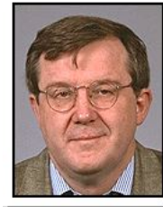
Figure 3: Klaus Schulten

09:15-09:40 Opening Remarks 09:45-10:40 Molecular Graphics Perspective of Protein Structure & Function Break 10:50-11:50 Molecular Dynamics Method 11:50-12:00 Daily Q & A Lunch 14:00-14:40 Overview of Hands-on Sessions 14:45-18:00 Molecular Graphics Tutorial (R. Braun, M. Gao)