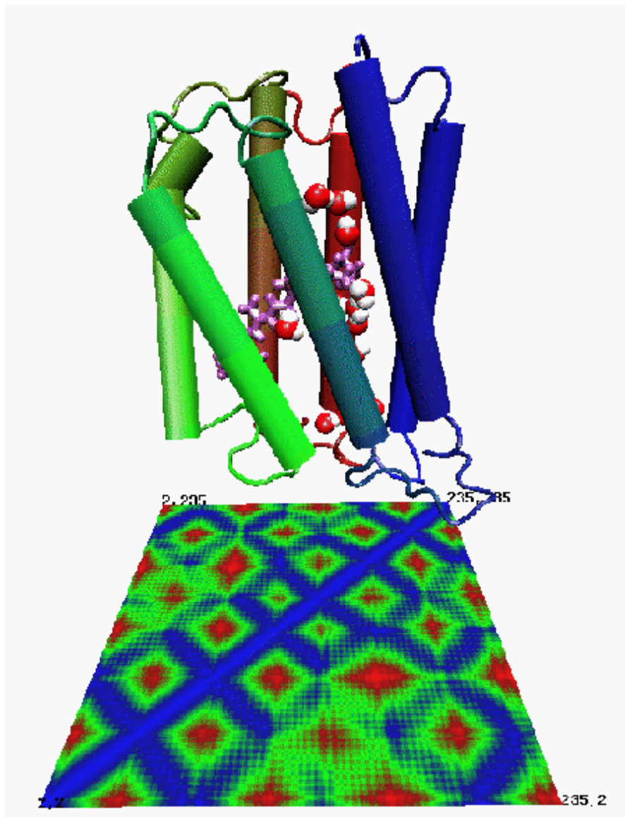
Figure 4: C_{\alpha} - C_{\alpha} distance plot of the bacteriorhodopsin protein. The protein visualization, distance calculations, and 2D plot were made in VMD